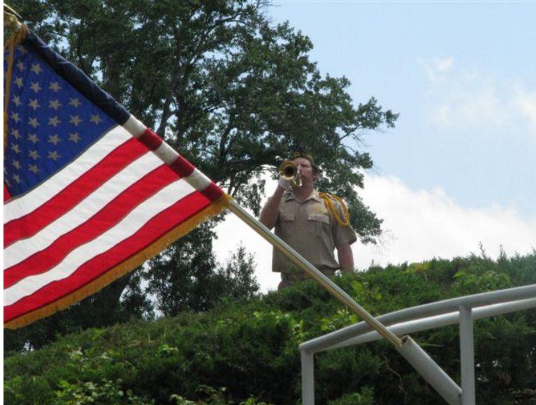
VFW 12th District Honor Guard Bugler - Memorial Day 2008 Hill Crest Cemetery