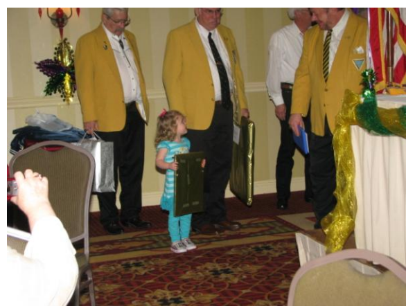
Gifts and gift bearers came in all sizes.