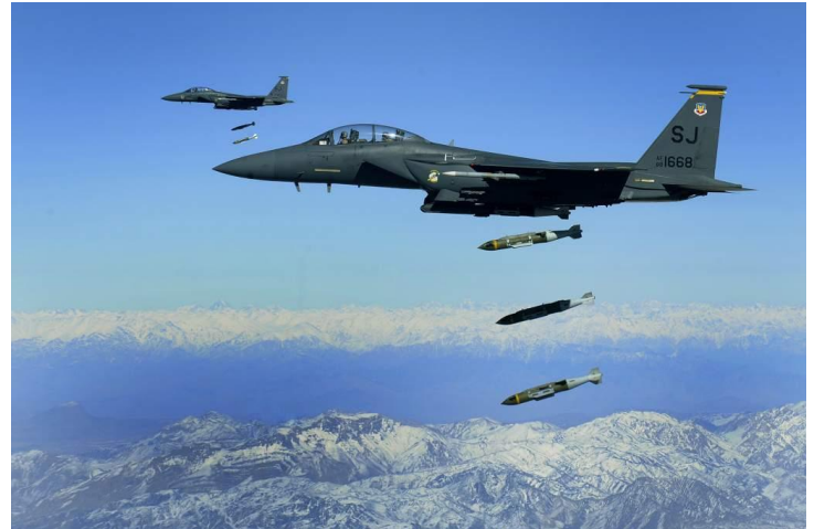
F-15Es from 389 th Fighter Squadron dropping bombs on a target in Afghanistan. They are part of the 455 th Air Expeditionary Wing.

We have about 3,500 personnel making this one of the largest wings in the entire Air Force. We are equipped with F-15, F-16, C-130, MC-12, EC-130H, HH-60G, plus some use of C-135 and C-17 for evacuation of wounded. We support the ground forces in close air support and basically drop bombs on the bad guys. We strafe some, but the A-10s in the south do most of that. This is some of the most rugged terrain in the world and obviously is a challenge with a tribal culture like Afghanistan. Tribal leaders and elders have all the power here and democracy is not in their vocabulary. There is less infrastructure here than just about anywhere else in the world, which adds to its being a dangerous place. Plus there are the 7 to 10 million mines the Soviets left from the 1980s. We have some of the best warriors in the world here and this is by far the busiest and best wing in the U.S. Air Force right now, so we can all be proud.