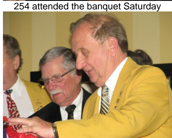
254 attended the banquet Saturday